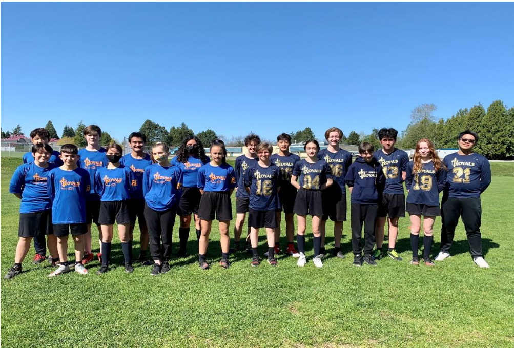
SJP2 Royals Ultimate Team