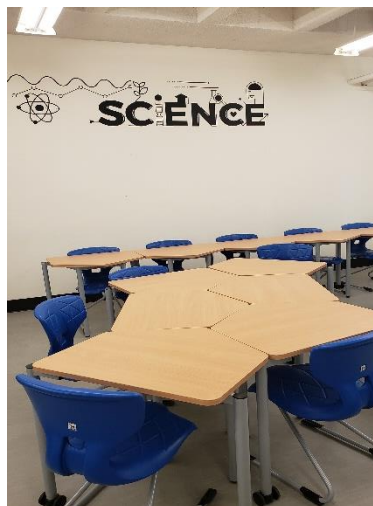
Test Tables and Chairs in Room 102B

The latest offering from the Vocations Club (aka The Happiness Club) was the hosting of a 'St. Patrick's Day Help & Hockey' get-together during Spring Break. We set up tables on their sides in the gym to create a huge 'rink', and played a fun and competitive two and half hours of hockey. Why Saint Patrick's day? It's a little known fact that before the Maple Leafs, Toronto had an NHL team called the St. Patricks - who actually won the Stanley Cup in 1922. Plus, St. Patrick is an amazing Catholic evangelist!