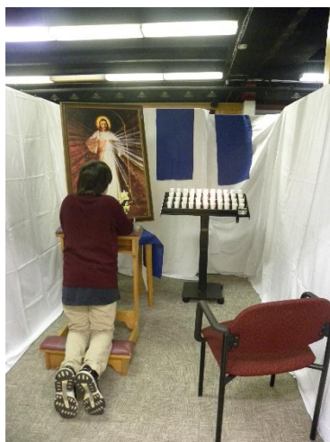
School Prayer Corner