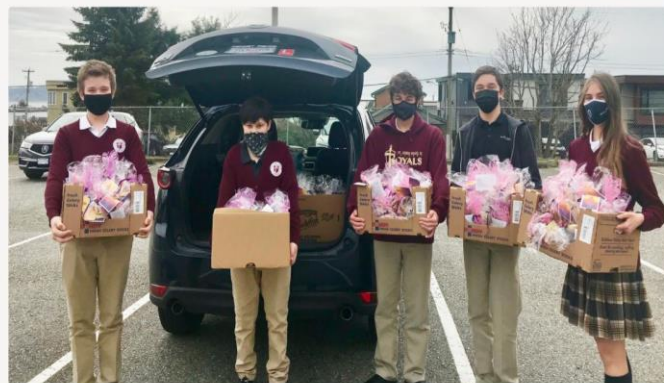
Easter cookies packaged by students of Saint John Paul II Academy.

Catholic communities also sprung into action this Easter, finding ways to share hope and joy with neighbours. St. John Paul II Academy students packaged 300 goodie bags with cookies (baked by the Helpers of St. Ann and St. Joachim) for the homeless.