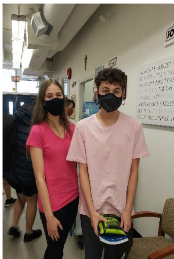
Our Students in Pink Shirts

Every year our school participates by wearing pink on Pink Shirt Day. The day is dedicated to promoting anti-bullying in our school community. As a school that is comprised of a diverse group of staff and students, it is important that we encourage each other to create an inclusive environment for everyone at SJP2. Our students wore their pink shirts proudly that day which is a testament to our school motto "Enter to learn. Leave to serve". We teach students to accept everyone and we hope that these values that we instill in them stay with them when they graduate from SJP2.