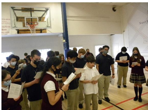
Stations of the Cross