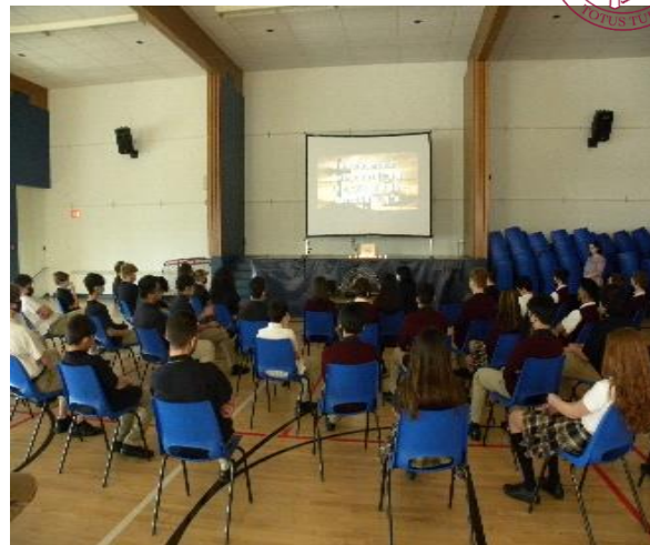
Prayer Service: Jesus' Seven Last Words