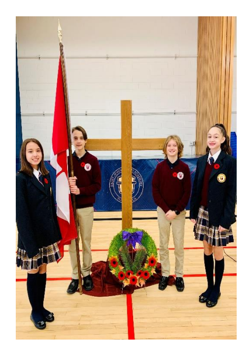
Grade 8 students