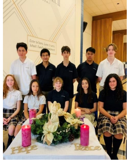
Grade 9 and 10 students with our school wreath