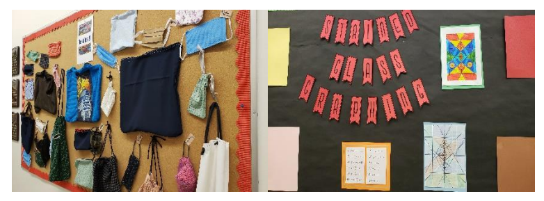
Robotics and Humanities students

As for the other English classes, the grade 8s are learning how to read and analyze poetry, and shall be creating an anthology, dealing with the topic of "Relationships." The grade 9s are in the middle of a short story unit and are looking at how authors use various literary elements in their stories.