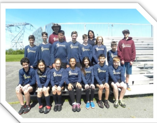
Ultimate Team at playoff tournament in Surrey