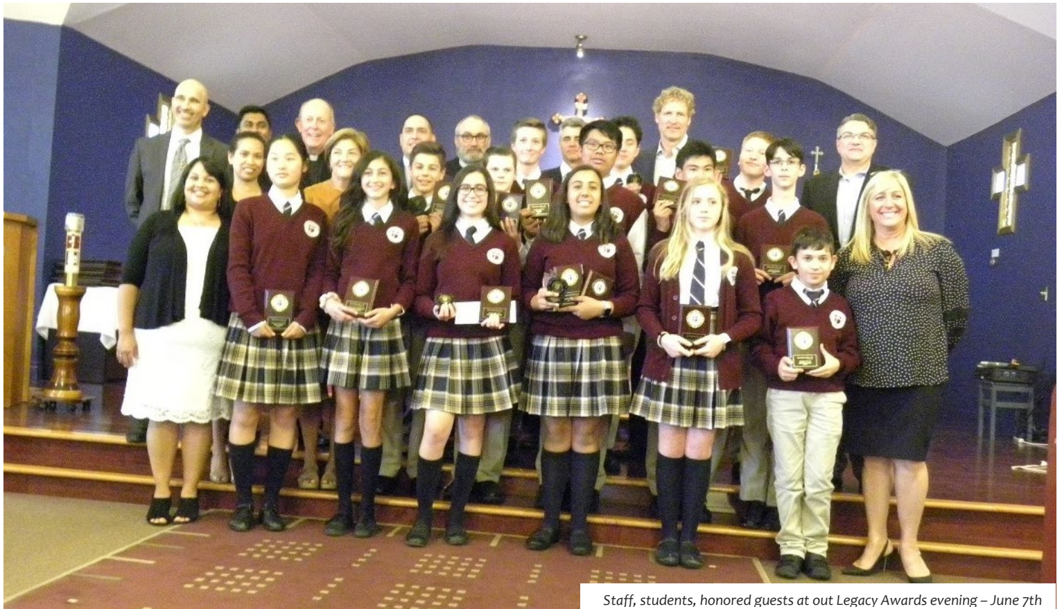
Staff, students, honored guests at our Legacy Awards evening – June 7th

We congratulate all the students for their remarkable achievements and personal growth during this past year. The staff have no doubt that each student will contribute to the future well-being of our school and community through their God given talents and the support of their families.