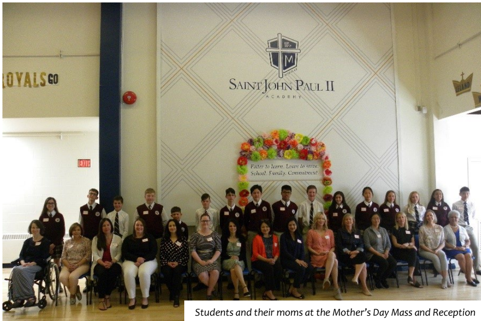
Students and their moms at the Mother's Day Mass and Reception

Masses to honour all Mothers and Fathers of our school community were held on May 8 th and June 13 th , 2019. These two beautiful events also included extended members of our community: parents of future grade 8s, parishioners from Star of the Sea church and the Knights of Columbus joined our school mass and reception. Students organized the holy celebration, participating in the preparation of invitations, readings, altar serving, music ministry, as well as learning the role of a server at the reception. Mothers were presented with a rosary-style bracelet and Fathers received a prayer card with details of a Mass celebrated in their honour. The growth and development of our school community would not be possible without the stupendous support of the parents of our students at SJP II Academy. We thank God for the faith and vision, and we pray that they continue to receive His graces and abundant blessings.