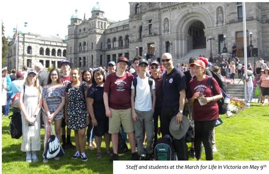
Staff and students at the March for Life in Victoria on May 9 th