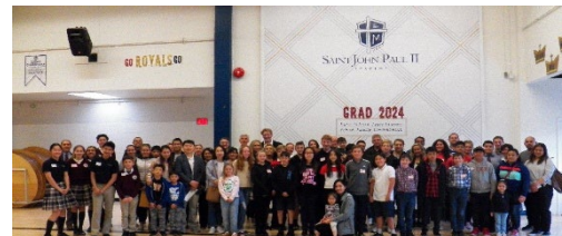
Gr. 8 Orientation Evening for students and parents held on June 5 th .