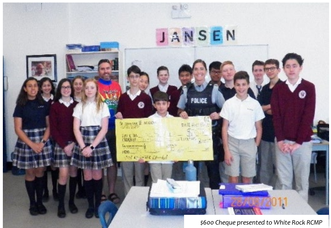
$600 Cheque presented to White Rock RCMP