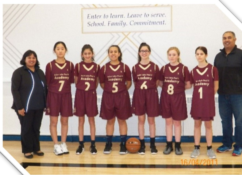
Gr. 8 Girls Basketball Team