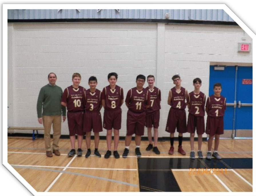
Gr. 8 Boys Basketball Team

The boys played exhibition games starting in January. We had three games scheduled but only played two as the day of the last game was a snow day both for us and for Pacific Academy. That was too bad. At least we got to play two games, both of which were a great learning experience for the boys. Leading up to those games we had plenty of practices. Our first game was against Johnston Heights Secondary. They took it easy on us, which was great because we could experience what it was like to play together, against an opponent, with referees, and build our skills. We made good passes, scored baskets, dribbled well, and encouraged each other. Our next game at Clayton Heights was more of the same: skills building and development. Overall, a season of fun and learning!