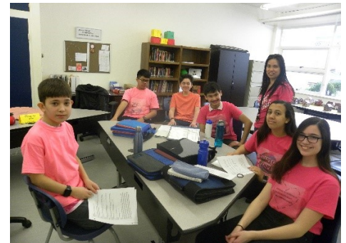
Pink Shirt Day

The Fundraising Committee would like to thank everyone who came out to support St. John Paul II Academy's first pub night! A huge thank you to all the volunteers who made the pub night a great success. The community building event was held at the Bennett Craft and Kitchen in South Surrey where 57 family members and friends took part. The Fundraising Committee raised over $6000 which will be utilized in a variety of ways to assist both our present and future students. Overall, we have raised $7690. We look forward to finding more ways to engage our community and help our growing school.