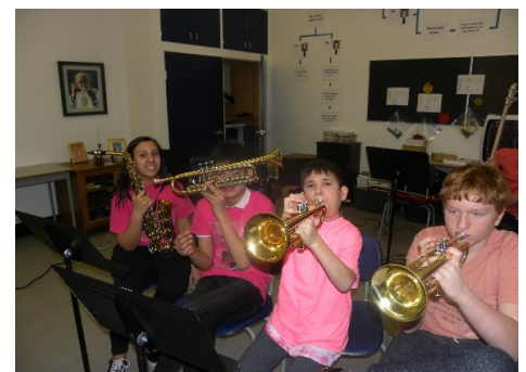
Gr. 8 Band Program started on Pink Shirt Day